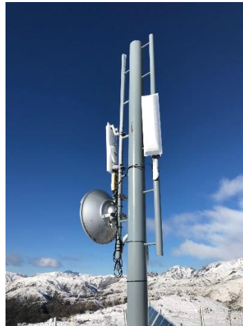
AmuriNet - Glynwye